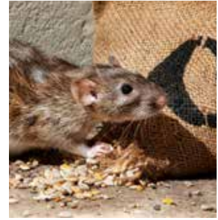
Even a small rodent population will consume and contaminate as much as 20 tons of feed annually. 3

A leader in providing sustainable solutions, BASF offers the industry's most innovative, effective and efficient solutions. We stand behind our products, and support our customers with comprehensive training and expert technical assistance. When you have questions, our dedicated sales support is available to provide answers and to help make your job easier.