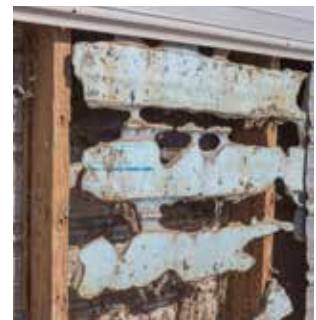
Rodents damage your facility in many ways, including gnawing on electrical wires and destroying insulation.