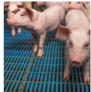
Downtime is the best time to control rodent infestations. Unfortunately, most anticoagulant baits can take far more time, up to 28 days, to gain control. Selontra® rodent bait controls populations in as fast as seven days, fitting downtime schedules.