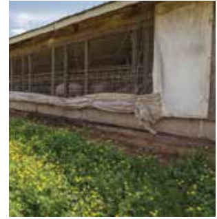
Eliminating overgrown vegetation and controlling clutter are essential steps in reducing rodent harbourage sites.