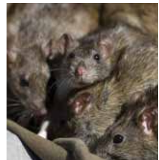
Carriers of at least 45 diseases and 200 human pathogens, 2 rodents are responsible for an estimated $207 million in Salmonella-related medical costs due to pork products annually. 4